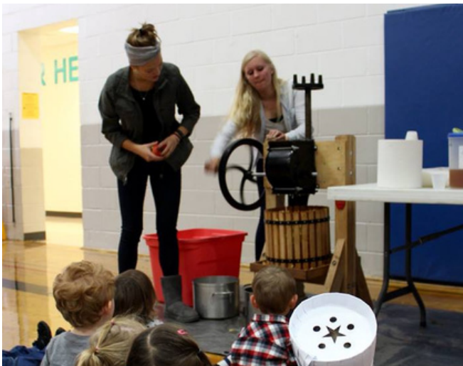
Make apple cider with students!